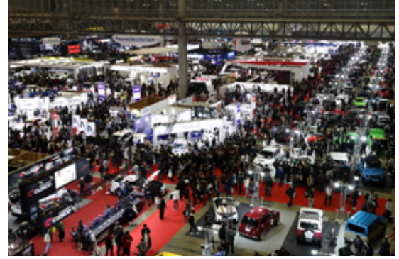
Previously held TOKYO AUTO SALON 2020

Visitors and staff members safety is always top priority of TAS. We are committed to providing even safer and richer event in a new style while exerting every possible effort to take proper measures to prevent infection.