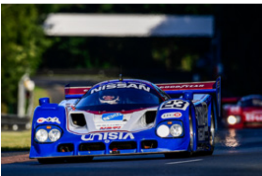
1990 Le Mans 24 Hours entrant Nissan R90CK up for the Auction.

* The lineup will be updated at BH Auction's website < http://bhauktion.jp > in early December.